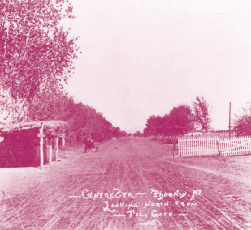
~ CENTRE ~ PHOENIX AZ. Looking North from ~ TOLL GATE. ~ 1906